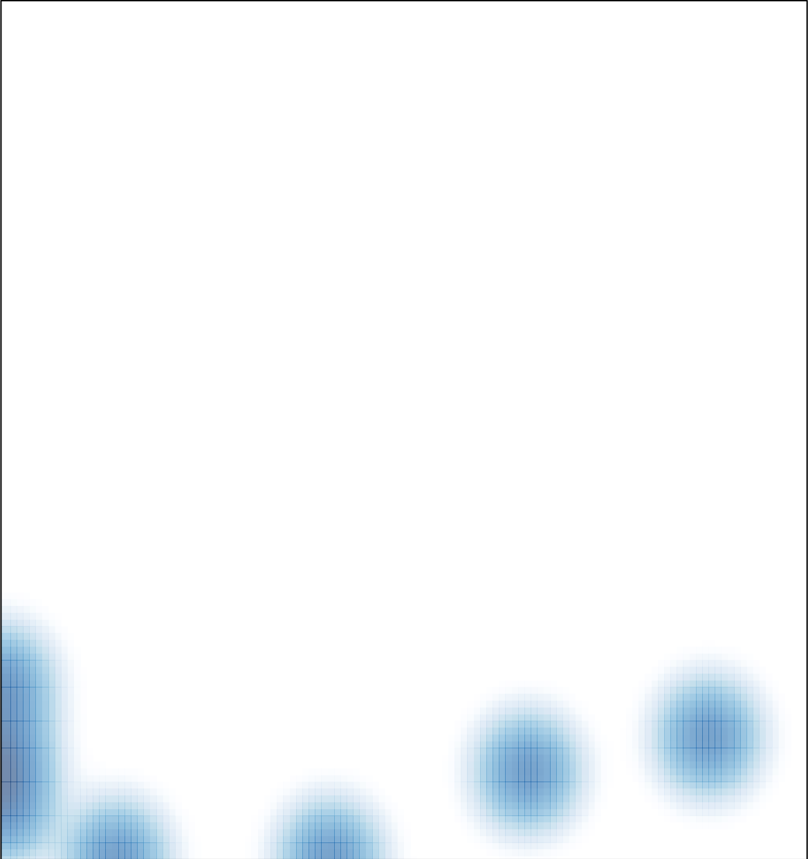
# features = 10 , max = 1